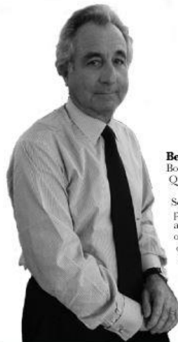
Bernard "Bernie" Madoff

Born in the New York City borough of Queens, on April 29, 1938.