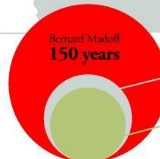
Number of years sentence for those involved