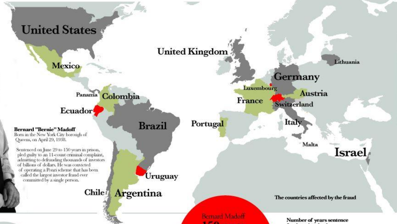
The countries affected by the fraud

Sentenced on June 29 to 150 years in prison, pled guilty to an 11-count criminal complaint, admitting to defrauding thousands of investors of billions of dollars. He was convicted of operating a Ponzi scheme that has been called the largest investor fraud ever committed by a single person.